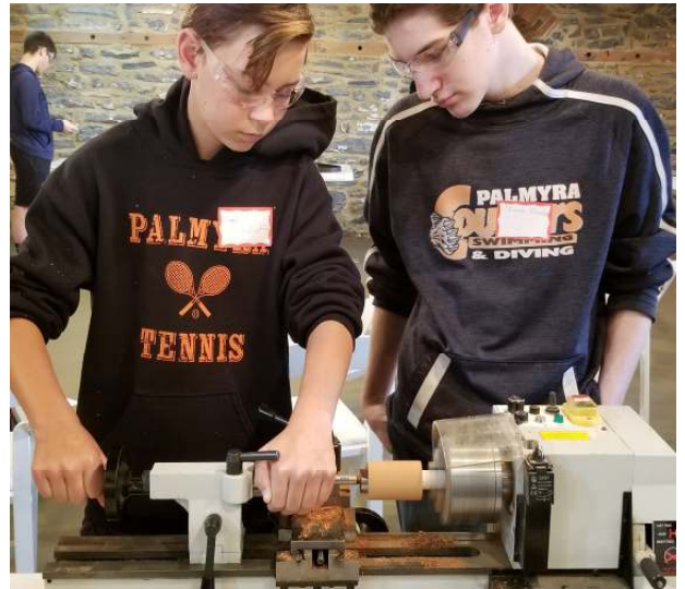
Students use a lathe to carve a cup for a Ball and Cup game.

These educational programs meet Rock Ford's mission to inform and educate the public about the life and times of Edward Hand. We are pleased to partner with I.U.#13 and Millersville University to offer these opportunities to local students.