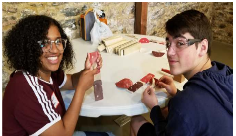
Students work on sanding their skyhooks, an 18th century balancing toy.