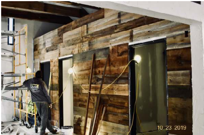
Views of the construction progress: Looking from the new addition on the rear of the barn into the gallery space (left) and the granary wall in the addition (right).