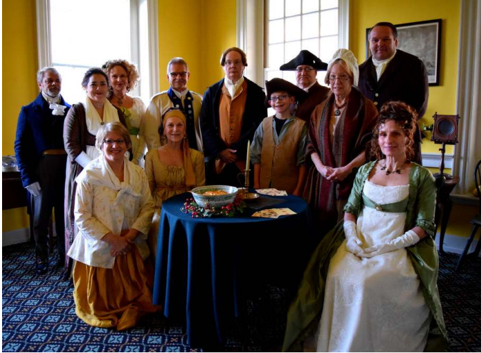
Photos from Rock Ford's 2018 Yuletide tours: Citrus fruits, such as this orange tree on display in the dining room, would have been a precious food commodity in the 18th century and would have been used decoratively on only the most elegant of special occasions (left), and period garbed Rock Ford volunteers pose in the Gold Parlor during daylight Yuletide tours (right).

Rock Ford acknowledges and thanks our 2019 Season Sponsors for their generous support: