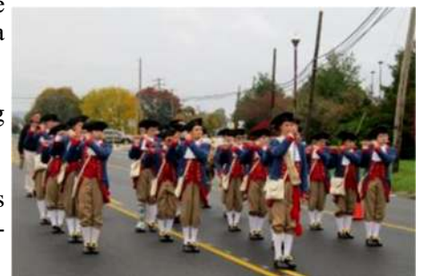
Photo on right: Musical entertainment for this event will be provided by students from the Central York Middle School Fifes & Drums. The group will be performing outside the Rock Ford mansion.

Rock Ford would like to thank Rhoads Energy Corporation for being a Supporting Sponsor for this event.