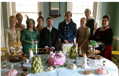
Rock Ford volunteers in festive 18th Century attire during the 2017 Yuletide Tours (above) and two docents displaying women's fashions in the Master Bedchamber (right).

During the period when General Hand and his family lived at Rock Ford, Christmas Day was only the beginning of a festive season of 12 days of parties, dinners and dances. Visitors to our Yuletide tours will enjoy learning about 18th Century traditions, watching period dancing by our volunteer dance group (candlelight tours only), listening to traditional holiday music by the musical group Seasons from Harrisburg and watching preparations in the kitchen by members of our Warm Hearth Club. Costumed volunteers will be stationed in various rooms of the mansion offering insight into 18th Century Yuletide traditions.